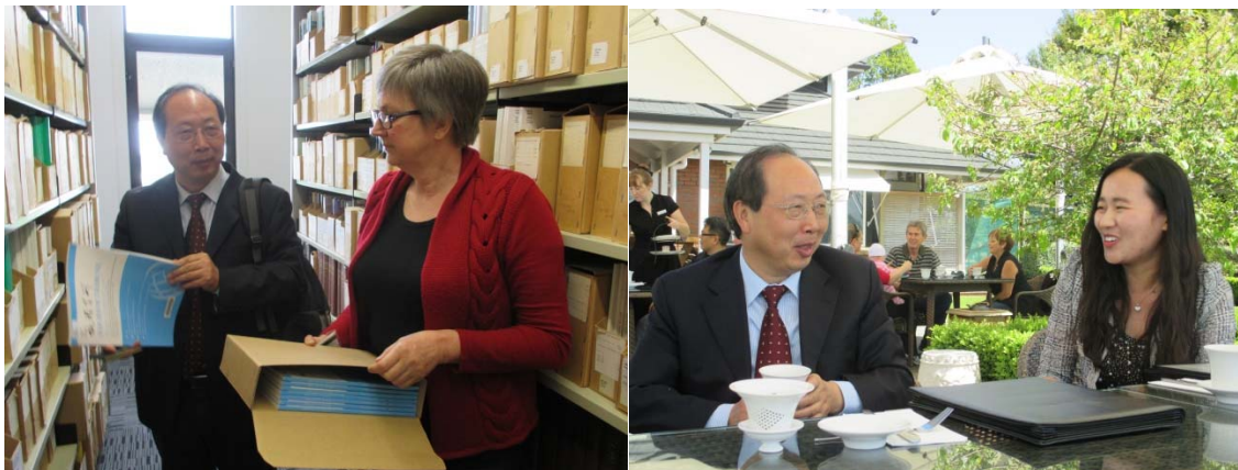
Figures One and Two

The China-New Zealand Tourism Research Unit has again had a busy year, although possibly not as busy as might have been wished for. Doctoral students have been supported with various grants including air fare and accommodation to Queenstown, sponsorship of the 11 th New Zealand Tourism and Hospitality Research Conference (including the provision of 4GB USB bracelets), continued research into Chinese tourist behaviour in New Zealand and additionally work in China, notably in Xishuangbanna-Dai Prefecture on the China-Laos border. The Unit also aided in the management of a visitation by the Deputy President of Beijing Union University (Huang Xiankai) in the absence of Pro-Vice Chancellor Ed Wymes and Professor Alison McIntosh, and the help of Associate Dean for Research, Delwyn Clark is very much acknowledged here.